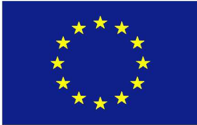
Fundamental Rights and Citizenship Programm 2008