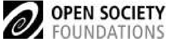
Open Society Institute