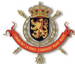
Flemish Representation of the Embassy of the Kingdom of Belgium in Warsaw