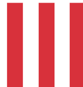
Embassy of the United States of America